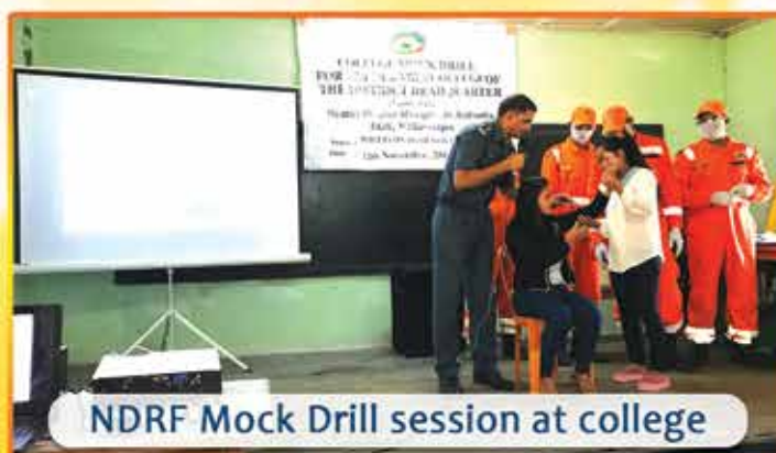
NDRF Mock Drill session at college