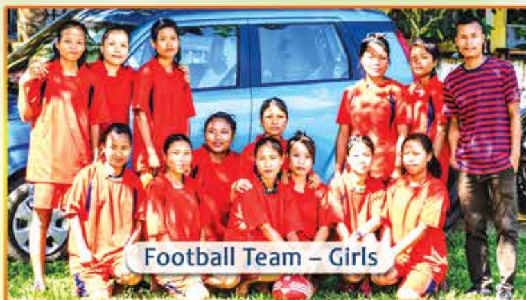
Football Team – Girls