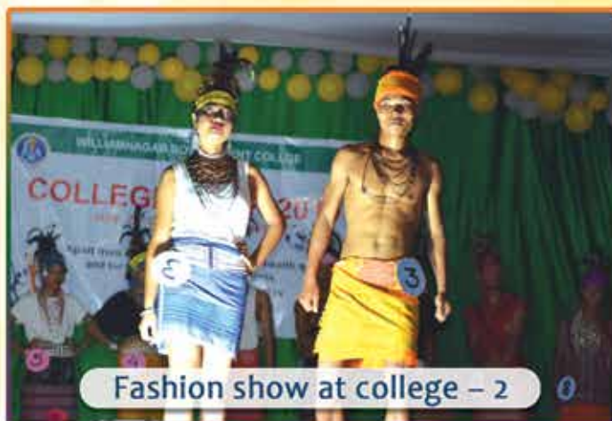
Fashion show at college – 2