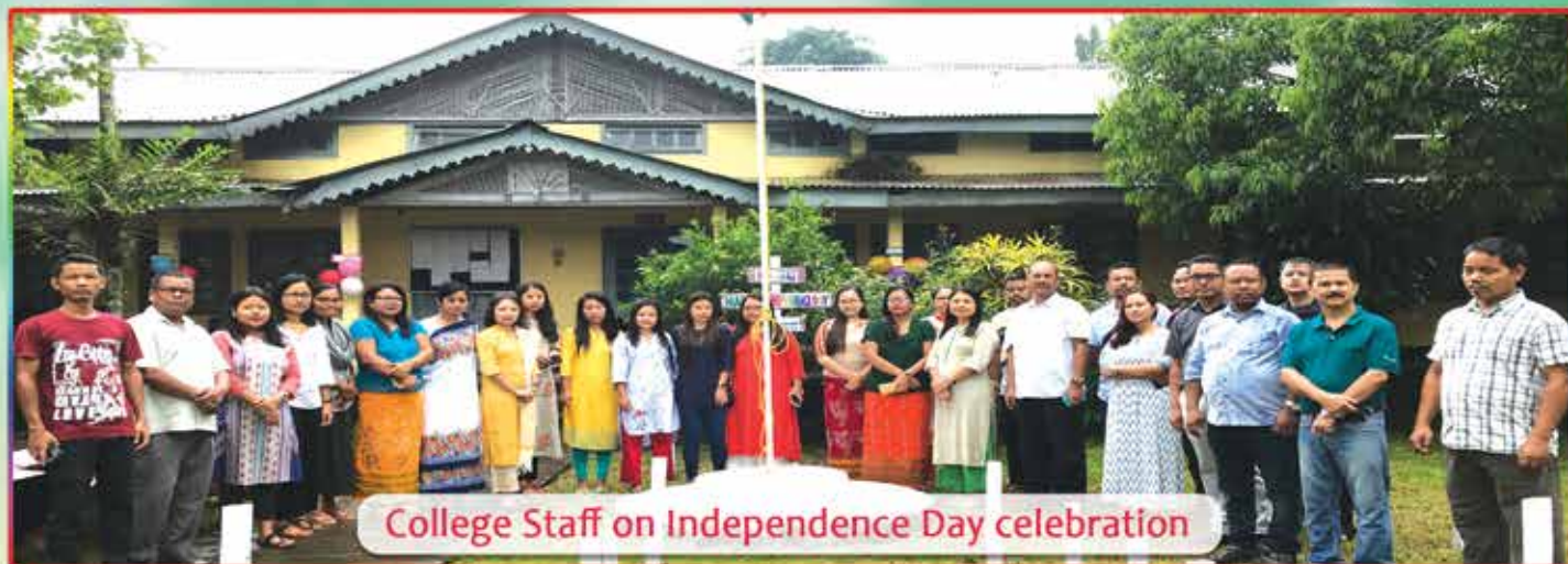
College Staff on Independence Day celebration