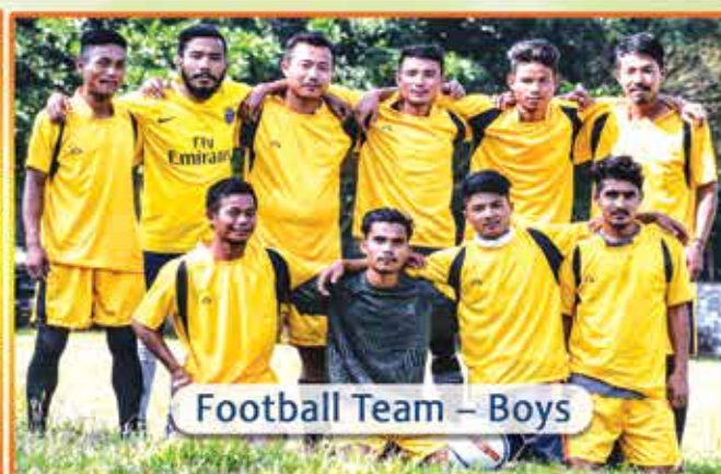
Football Team – Boys