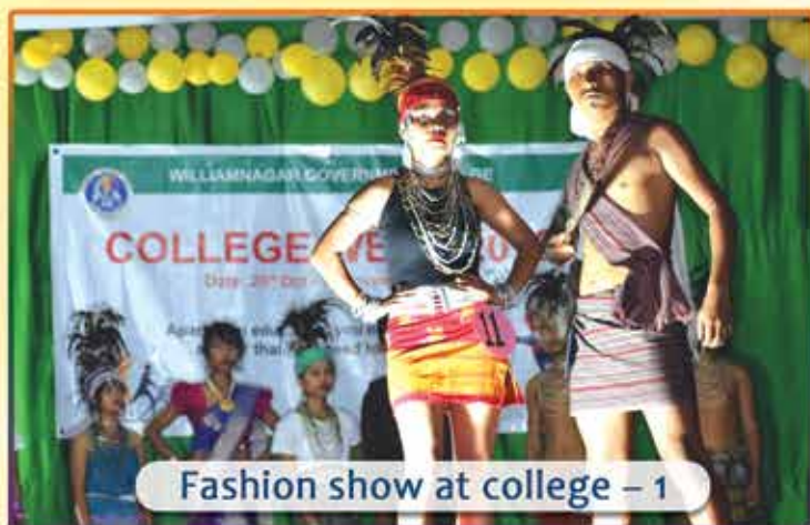
Fashion show at college – 1