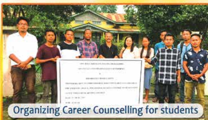
Organizing Career Counselling for students